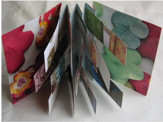
Flag book 'Textiles'