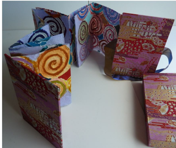
Pamphlet-stitched book 'Underwater' Map Book 'Seasons'

Gillian is offering 4 sequential workshops on Tuesdays 3 rd , 10 th , 17 th , 24 th of May. Each day will commence at 9.30 am and conclude at 12.30. All materials and morning tea will be supplied. The all inclusive cost will be $140.